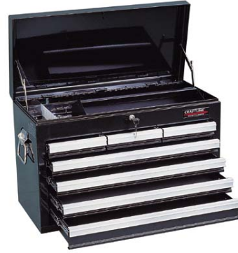
PL222-7BX 26" W x 12" D x 17" H