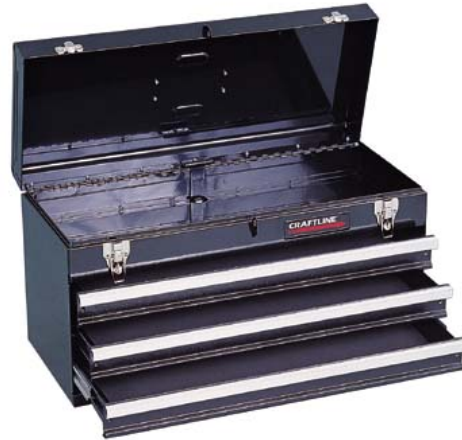
HP-213 21" W x 8.7" D x 11.4" H

Craftline's Portable Tool Boxes are available with 2 or 3 drawers. These Tool Boxes feature a comfortable heavy duty carrying handle and aluminum extruded drawer handles with identification strips. Craftline's Portable Tool Boxes are built from thick 22 and 23 gauge durable steel with "T" shaped drawer handles, "X" shaped supports for added drawer strength, and have a High Gloss Black Powder Coat Finish. Drawers slide in and out with ease using friction slides and the heavy duty locking catches assure the lid or drawers don't open unexpectedly. Built tough for everyday use.