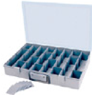
PL-32BP With 24 Adjustable Dividers

These large portable plastic service trays are great for storage of nuts and bolts, tools and small parts. Craftlines's plastic service trays have a gray polymer blend body with a durable clear resin cover. Two fixed and two adjustable configurations are available. All of our plastic service trays feature double locking latches, a comfort grip handle, a see through cover for quick identification of its contents, and are also rustproof, odor and oil resistant. Plastic service trays can be used with all Craftline Storage Racks.