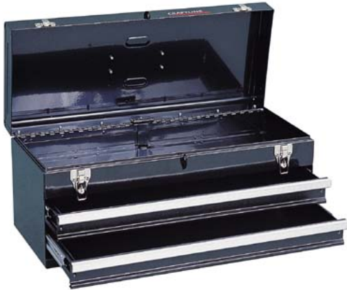
HP-212 21" W x 8.7" D x 9.1" H