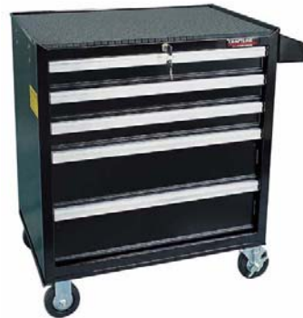
PL26-5X 26.3" W x 18" D x 30.3" H