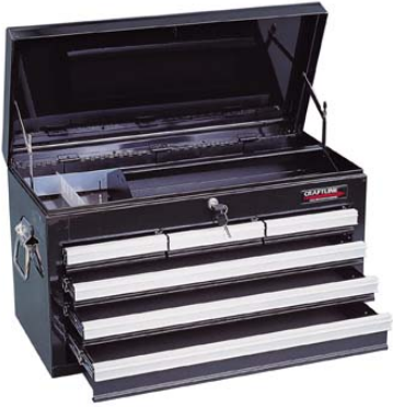
PL222-6BX 26" W x 12" D x 15" H