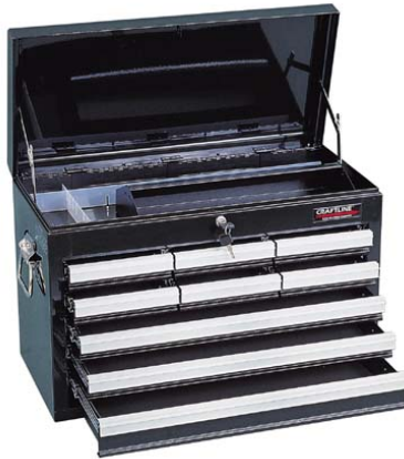
PL222-9BX 26" W x 12" D x 17" H

Craftline Tool Chests are available in 6 Drawer, 7 Drawer or 9 Drawer models. Each Tool Chest contains locking hinges, a carry tray and adjustable dividers in the top lid storage area. Additional features also include an internal locking system, and quick release slide trays. Built from 22 and 23 gauge durable steel with Craftline's signature High Gloss Black Powder Coat finish. Each drawer has "T" shaped aluminum extrusion draw handles and "X" shaped supports for added drawer strength. Protective draw liners are included for each drawer. The large drawers are equipped with easy rolling ball bearing slides with a Keyed locking system for security.