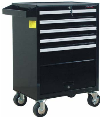
26.3" W x 18" D x 37" H