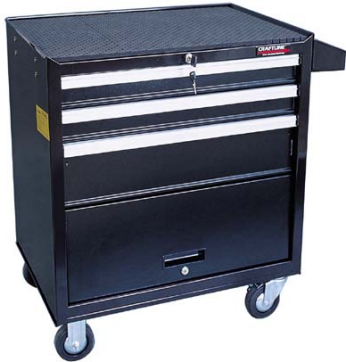
PL26-3PX 26.3" W x 18" D x 30.3" H