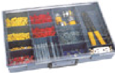
PL-16BP With 12 Adjustable Dividers