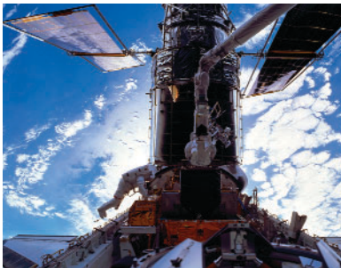
A true aerospace material, Ryton is ideal in satellite applications where weight and stability are of primary importance.