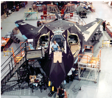
Flame resistance, strength and low weight make Ryton sleeving the first choice in high-tech aeronautic design specifications.